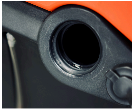
Accessible fill port with built-in level indicator for quick refills and accurate water monitoring.