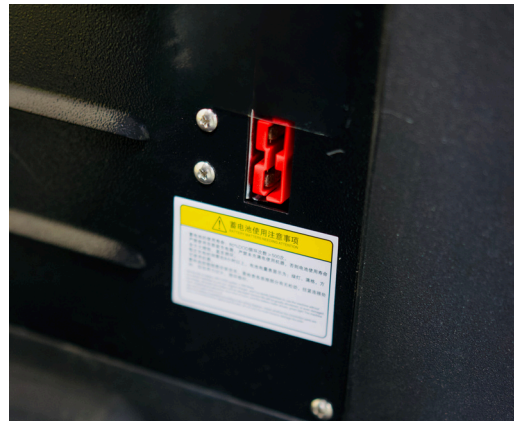
External charging port for easy charging.