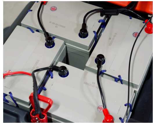
High-capacity, maintenance-free lead-acid battery provides long operating times.