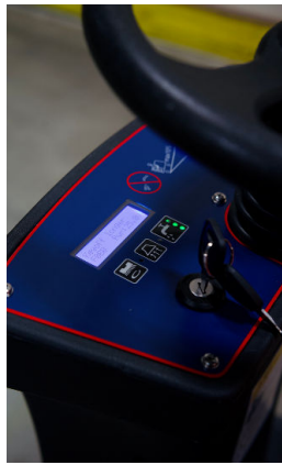
Easy-to-use buttons make operation simple and efficient.