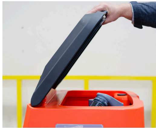
Quick access allows for fast cleaning and maintenance of the recovery tank, reducing downtime and keeping operations efficient.