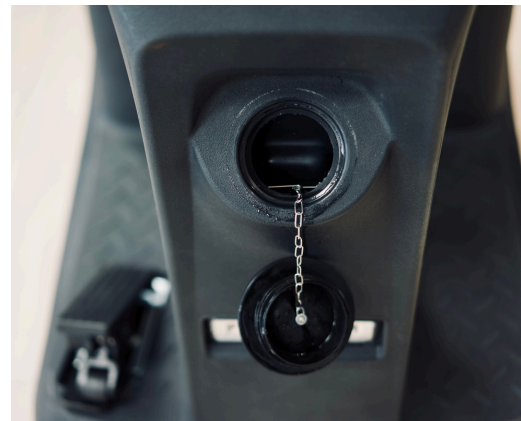
Easy-access water refill system.