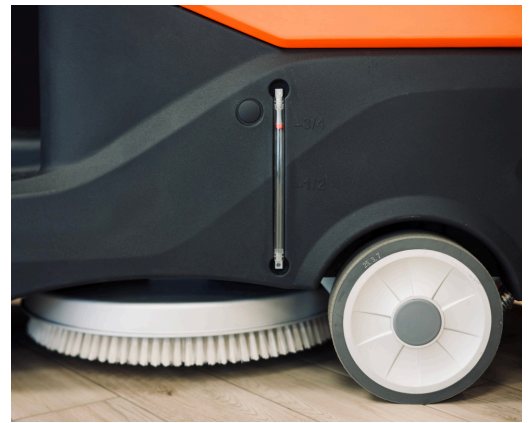
External water level indicator for quick, at-a-glance monitoring.