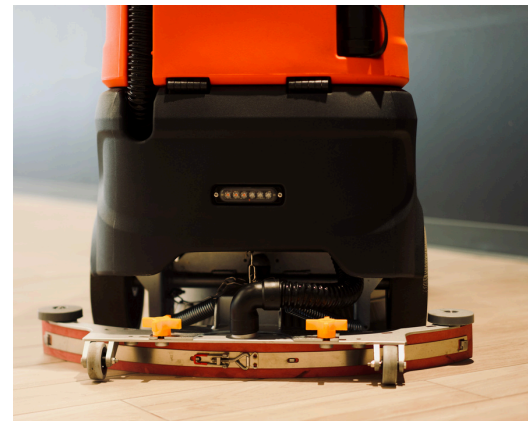
Easy-adjust squeegee with high-powered suction for fast, streak-free water pickup.