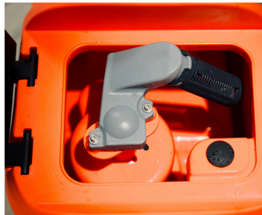
Quick and easy tank access for cleaning.