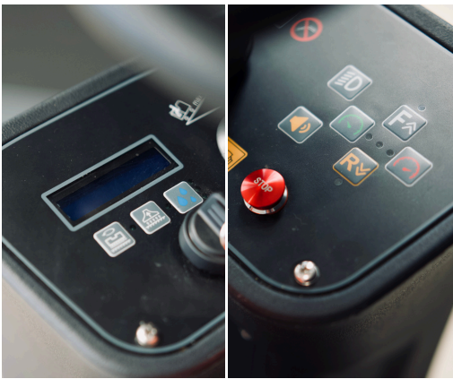
Touch controls for adjustable water flow and variable agitation speeds.