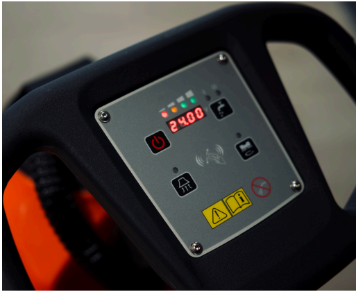
Clear, intuitive controls make operation straightforward