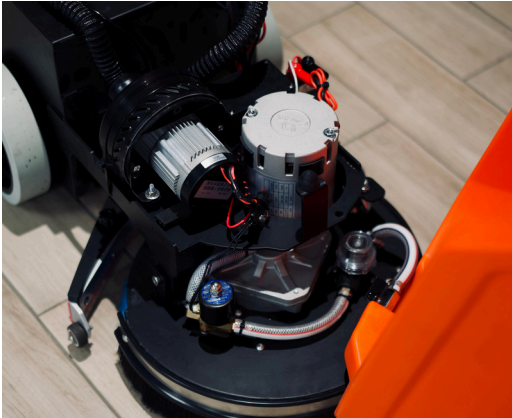
Vacuum and brush motors are easily accessible for fast inspection, servicing, and reduced downtime.