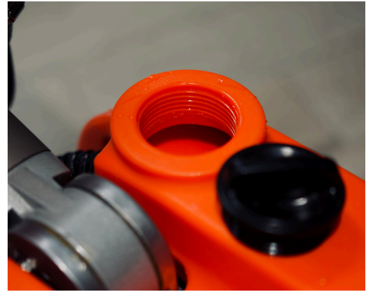
Accessible solution tank opening for quick, hassle-free daily refills.