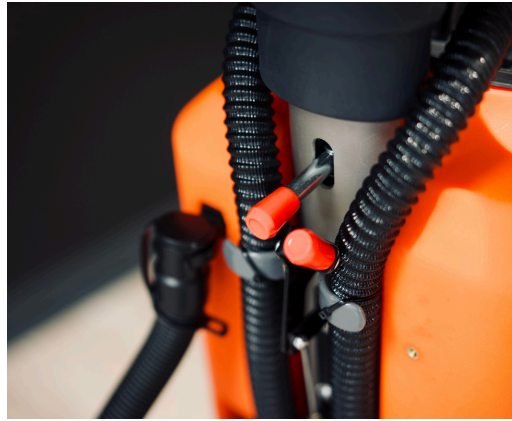
Convenient levers allow quick adjustment of operating height and effortless lowering or lifting of the squeegee.