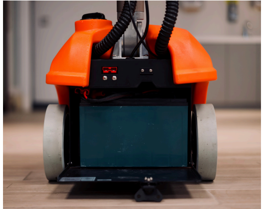
Accessible Battery & Charging Port designed for easy access, making daily charging quick and efficient.