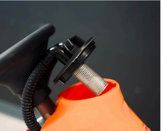
Dedicated dirty water tank ensures efficient wastewater collection and simple.