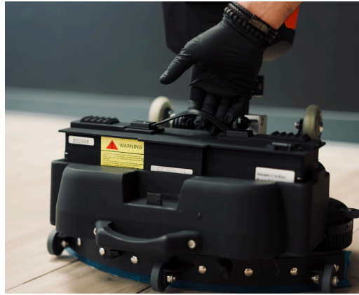
Battery is easy accessible for simple replacement and multi shift usage