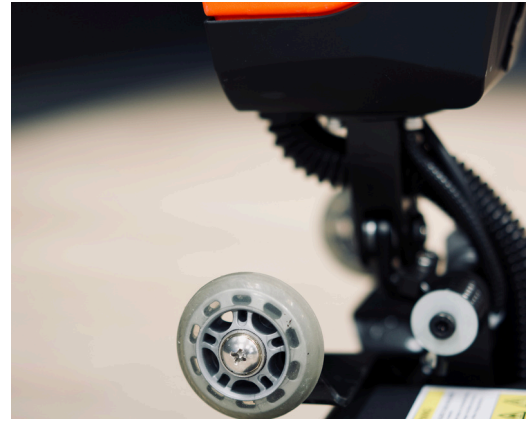
Makes transport easy