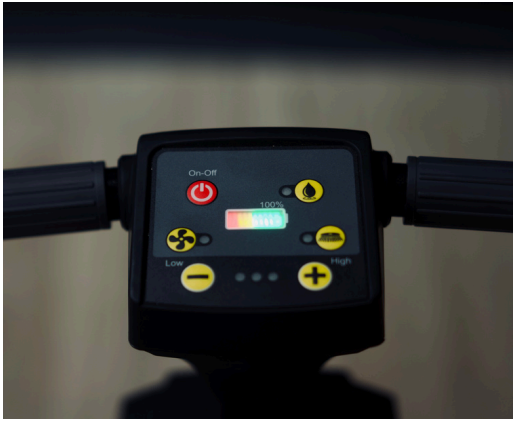
Touch controls for dual water flow rates, variable speeds