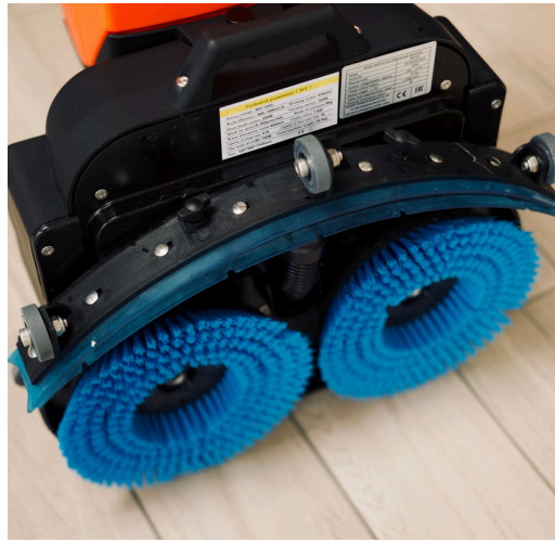
A removable squeegee helps for daily maintenance