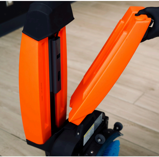
Brushes easy to remove for easy/simple maintenance and replacement