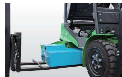
Side-pull battery (optional)