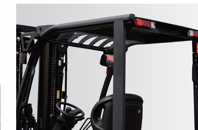
The entire forklift comes with LED lighting: Front headlights, front auxiliary lights, rear combination lights, and warning lights.