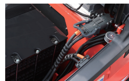
Multi-capacity, quick plug-and-play batteries