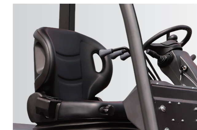
Seat: Standard with seat switch (optional seatbelt warning switch).