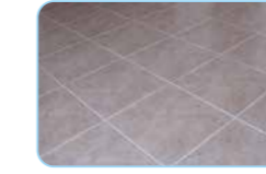
Small Square Brick Flooring