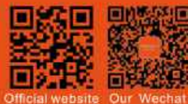
Official website Our Wechat

Add: 2461 S Wolf Road, Des Plaines, IL 60018 Tel: 847-595-7100 Fax: 847-595-7200 Email: ussales@nobelift.com Http: www.nobelift.us