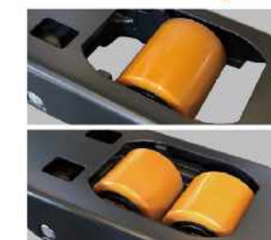
Optional tandem fork rollers