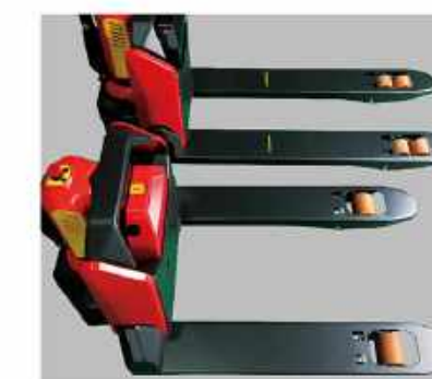
Optional different fork sizes