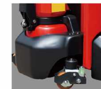
Additional supporting wheels